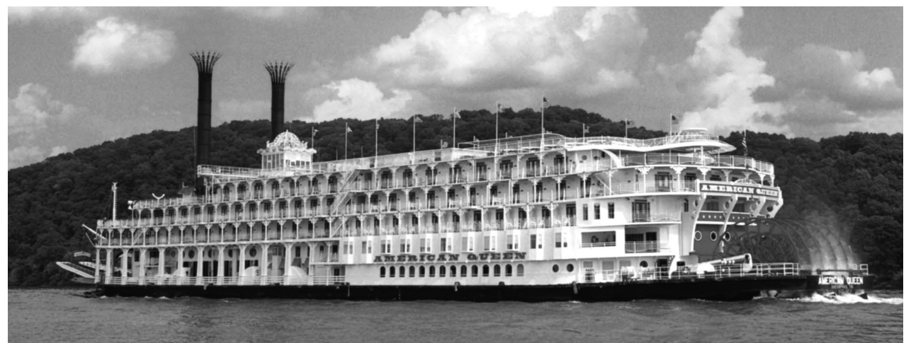
The American Queen

The ship features a diverse range of elegant and well-appointed accommodations. From economy inside staterooms to lavish luxury suites, each is decorated with Victorian-style furnishings and features plush bedding dressed with the finest linens, tasteful amenities and all of the modern conveniences you expect. Cruise from the port of New Orleans, Memphis or St. Louis on trips that