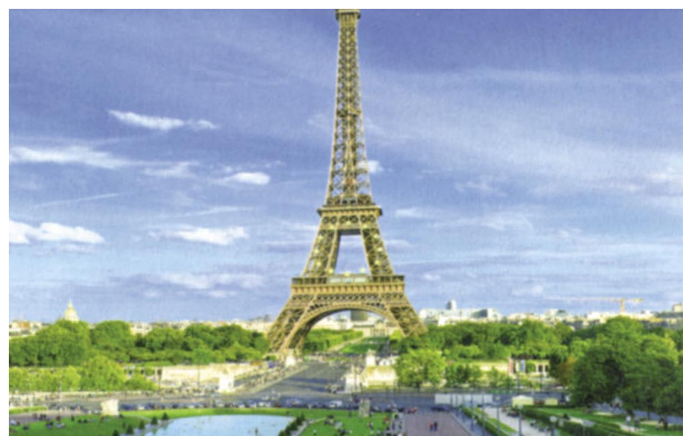
The Eiffel Tower