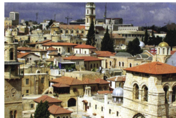
The old city of Jerusalem

Mass we waited in line to get into the Sepulchre of Jesus itself and touched the slab where the lifeless body of Jesus was placed after the crucifixion. We then visited the place where Jesus was nailed to the cross; where his body was prepared for burial; where the actual crucifixion took place and where Jesus carried on the cross – the Via Dolorosa. During the remaining days we visited the Garden of Gethsemane with beautiful old olive trees that may have been there during Jesus' time. We also went to the site of the Upper Room where Jesus is believed to have