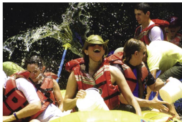
Rafting down a jungle river in Costa Rica

There were 10 different families on our tour with children ranging from age 8 to 17. They were accompanied by