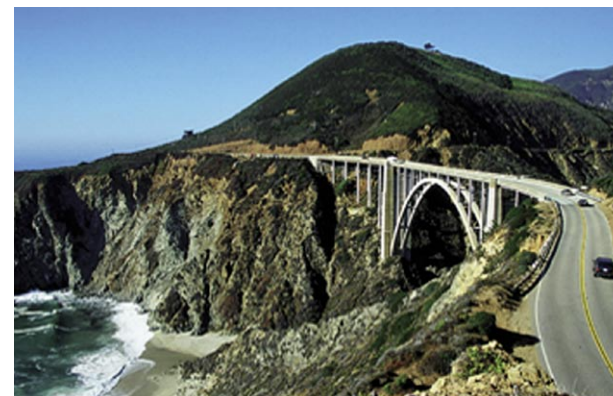
The breathtaking California coastline

From $2699.00 per person, double occupancy*