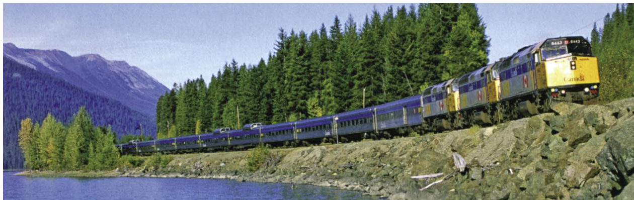
VIA Rail Train in the Canadian Rockies